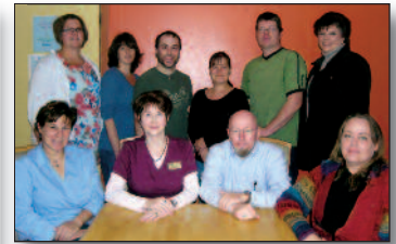
Homeless Services of Aroostook and ACAP partner to provide health services and education to residents of the Shelter.